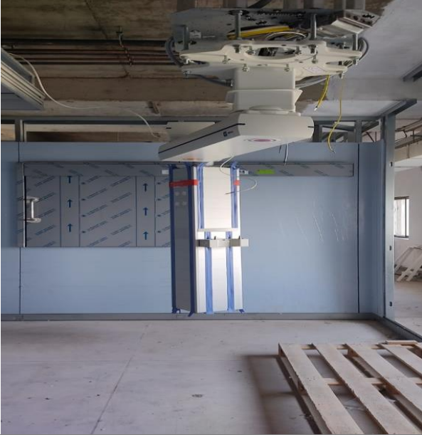
M.O.T 4, 5 and 6 Anesthesia Pendant Installed