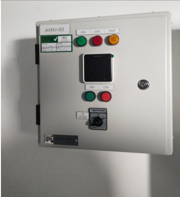
DCC Panels Installation Started