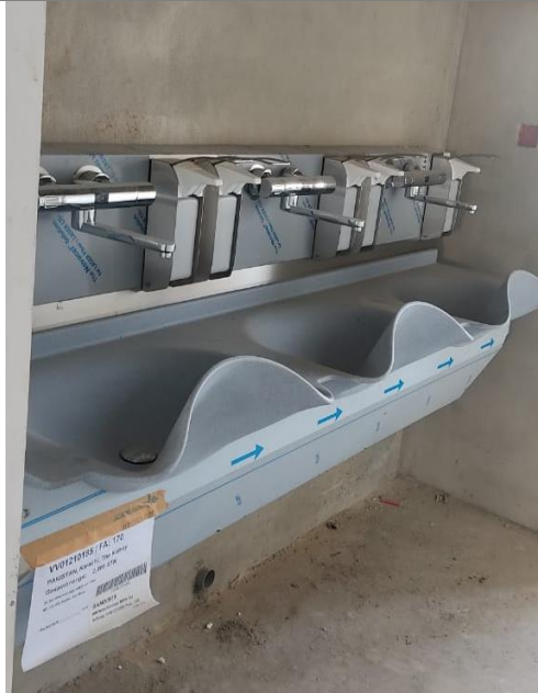
Scrub Unit Installed