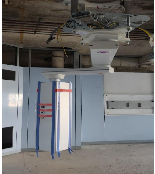
M.O.T 4, 5 and 6 Surgeon Pendant Installed