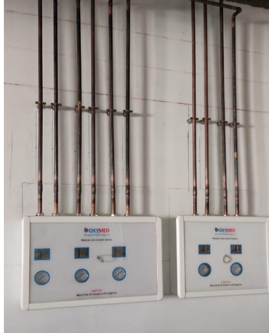
Medical Gasses Zone Valve Installed