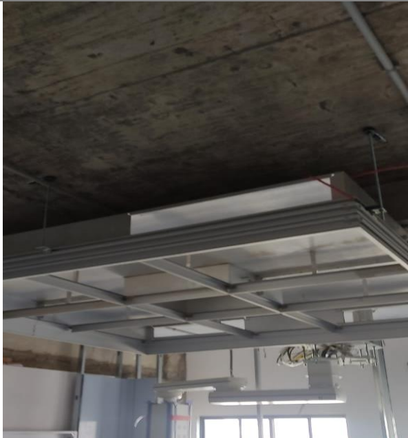
M.O.T 4, 5 and 6 Laminar Air Flow Installed