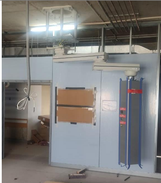
M.O.T 4, 5 and 6 Surgeon Control Panel Installed